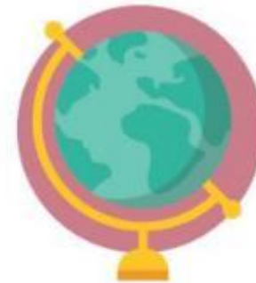
World of STEM