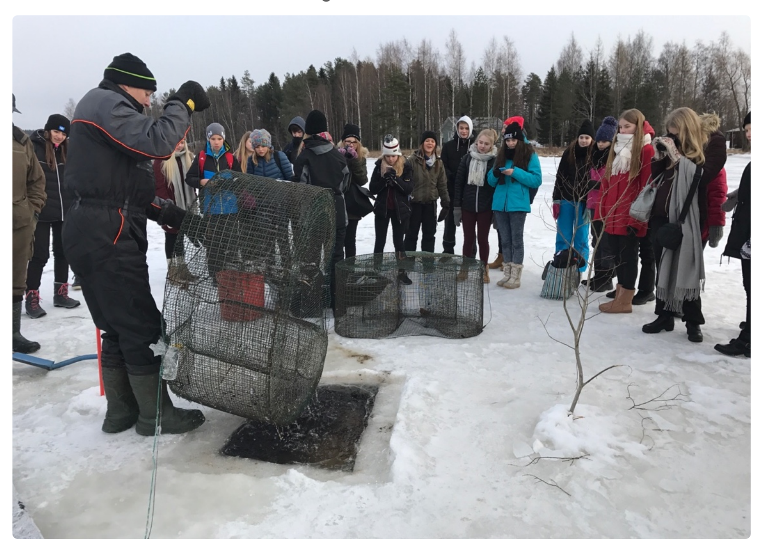
Being shown how to ice-fish.

Click on the arrows to the left and right of the pictures to see them! Click directly on the image to view in full-screen!