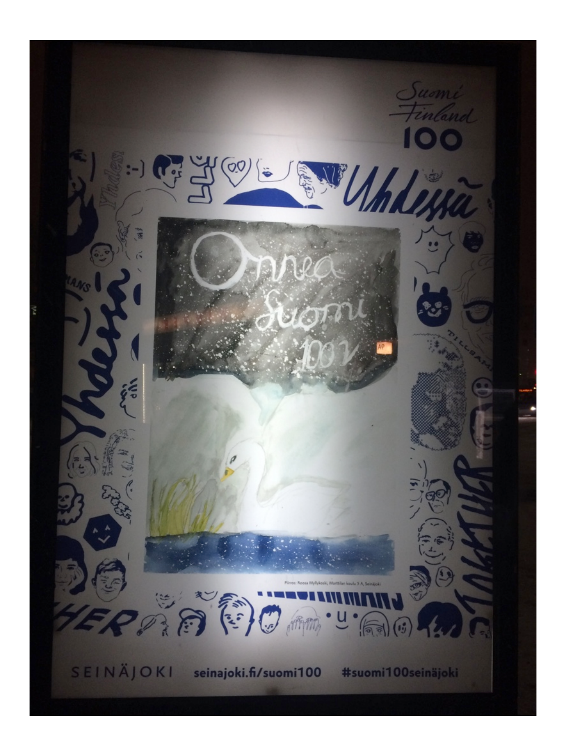
is a great year to visit Finland because in 2017 the country celebrates its 100th birthday!