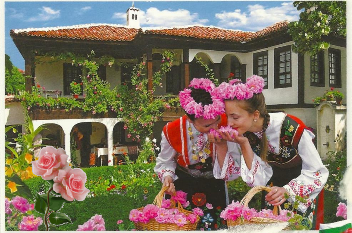
LAND OF ROSES