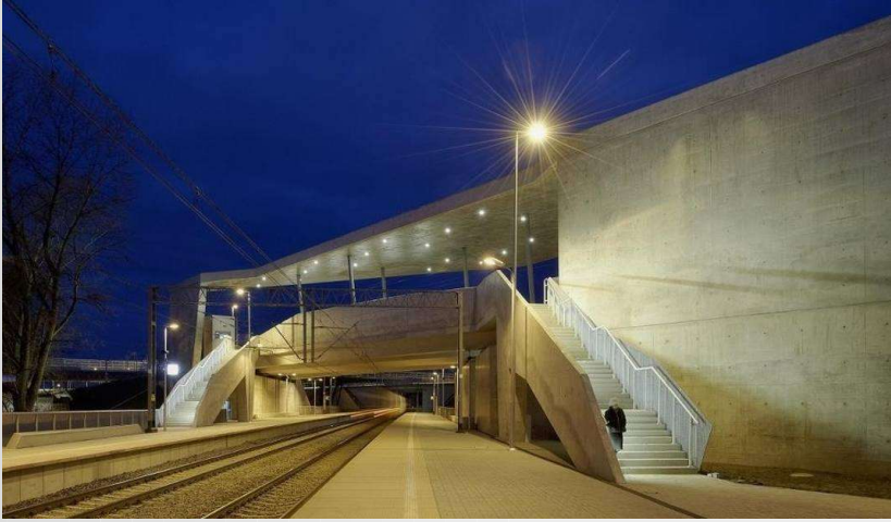
Station in Wrocław