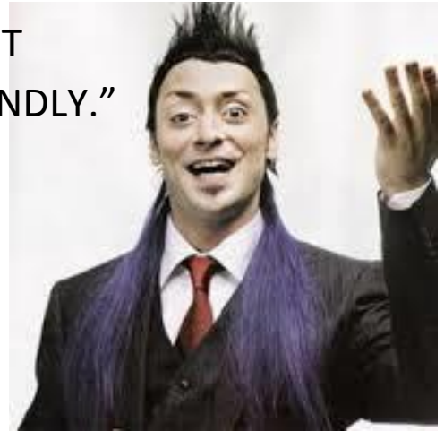
Hayko CEPKİN, a Turkish musician