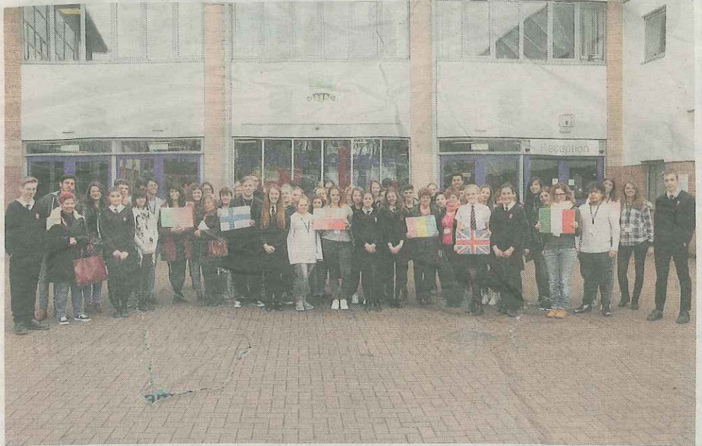
YORKSHIRE TRIP: The students had a great time taking part in activities and exploring the region.