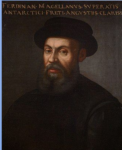
Ferdinand Magellan, the first circumnavigation of the Earth