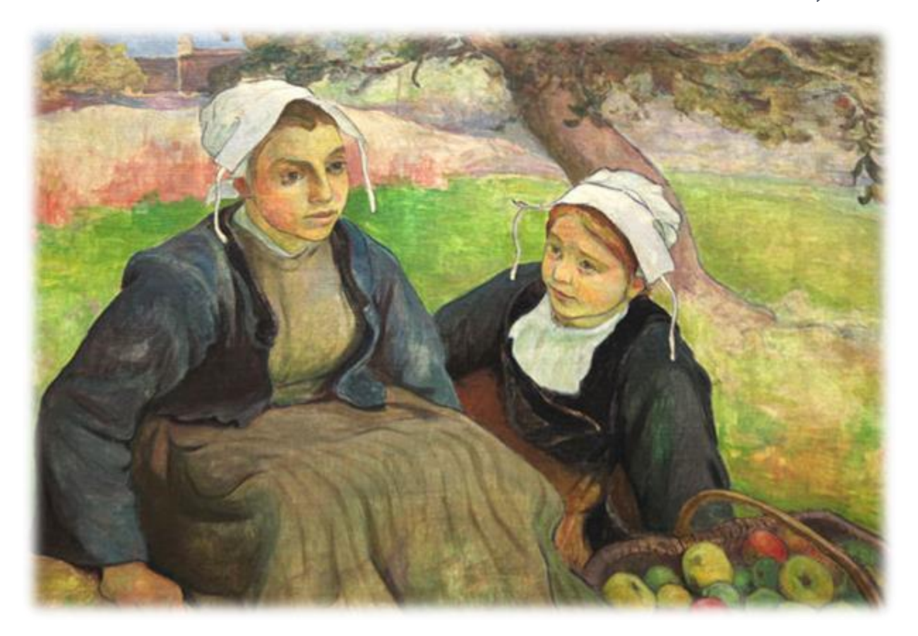
Image by Wladyslaw Slewinski 'Two Breton Women with a Basket of Apples' is in the National Museum in Warsaw, and there is every day exposed.

Painting: oil on canvas Dimensions: 82 cm × 116 cm