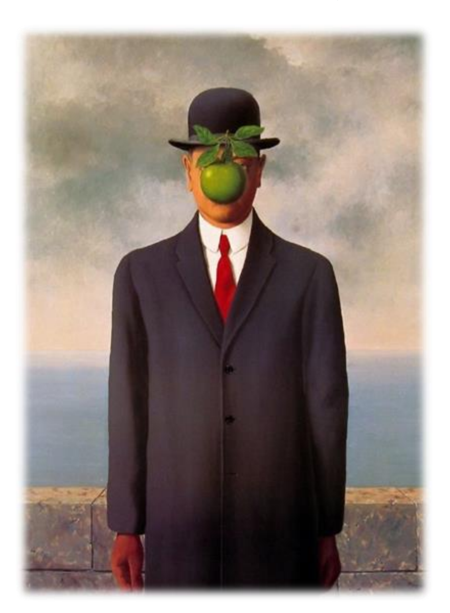
Image is a self-portrait. The painting consists of a man in an overcoat and a bowler hat standing in front of a low wall, beyond which is the sea and a cloudy sky. The man's face is largely obscured by a hovering green apple. However, the man's eyes can be seen peeking over the edge of the apple. Another subtle feature is that the man's left arm appears to bend backwards at the elbow.