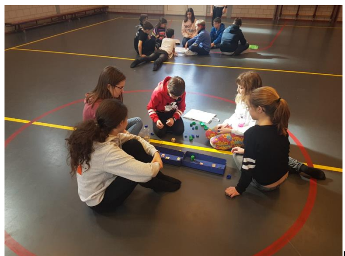
playing eco games in international groups