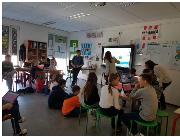
host lessons in international groups