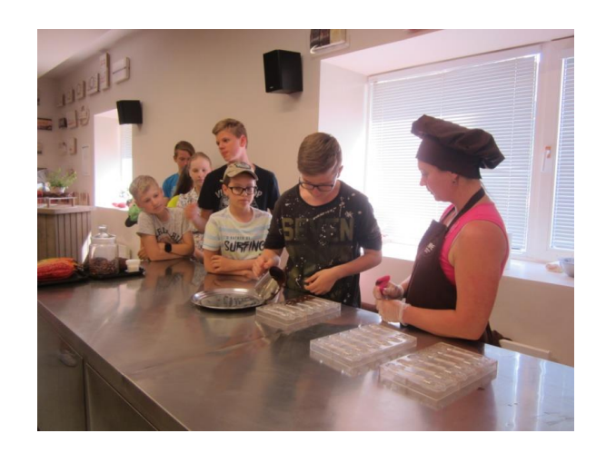
ECO-WEEK IN POLAND