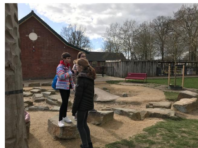
playing in the park and get to know each other.