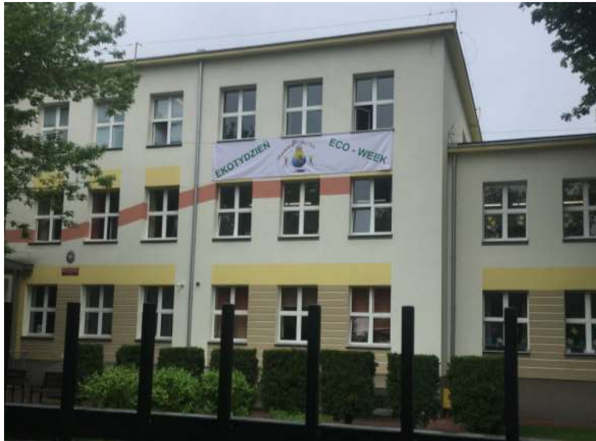
Primary School number 2, Puławy