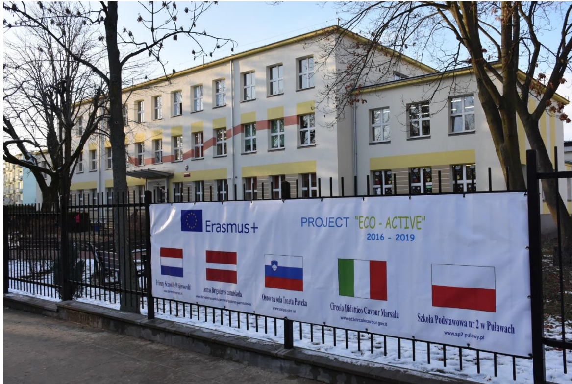
Szkoła Podstawowa nr 2 im. K.K. Baczyńskiego w Puławach

d) The banner advertising our project has been created: