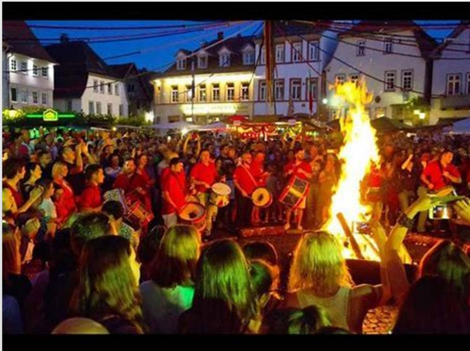
JOHANNISFEST (in June)