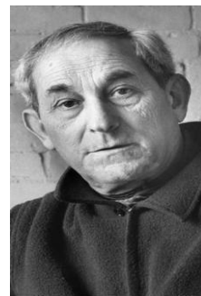
c) Naum Gabo