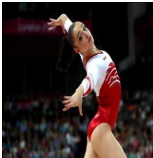
a) Alyia Mustafina

8. Which of these is Romanian gymnastic?