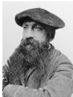
b) Auguste Rodin