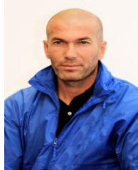
b) Zinedine Zidane