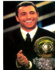
c) Hristo Stoichkov

8. Which of these is Romanian gymnastic?