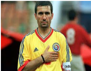
a) Gheorghe Hagi

7. Which of these is Romanian footballer?