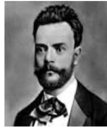
c) Antonín Dvořák

7. Which of these is Romanian footballer?