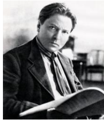
b) George Enescu