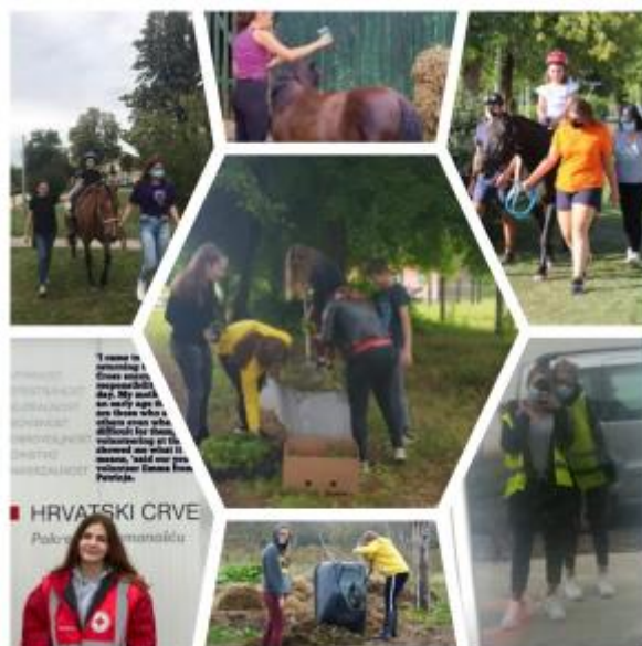
5 - Petrinja High School

The student partners in the project spent one day with the students of the special class department. In the joint gathering, we emphasized the importance of mutual acceptance, respect, inclusion, and we worked on communication and social skills by arranging class for the upcoming holidays.