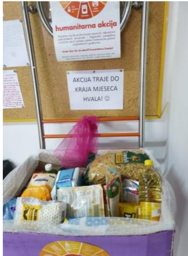
8 - School of Fine Arts, Split - help for the poor people in the city

Every year, our School and the Red Cross collect food and hygiene supplies for the poor in Split.