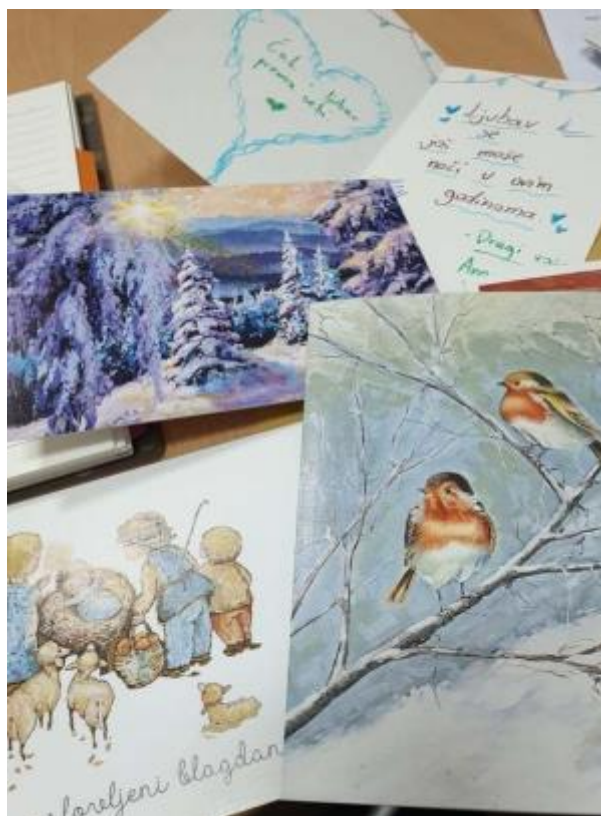
2 - School of Fine Arts, Split, Croatia

We participated in the humanitarian action of the Red Cross and collected selected items from food and hygiene packages in order to meet the basic needs of socially vulnerable groups in Vrgorac.