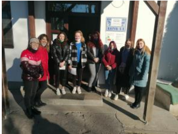
3 - Petrinja High School

This December, we decided to collect books for the users of the Petrinja Home for Mentally Ill Adults, which had to move to a temporary location in Ravnik near Popovača after the devastating earthquake. During the handover of donated books, the students did one hour of library therapy with the users of the Home. It was an exceptional experience for all the students and users present.