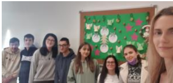
4 - SŠ Tina Ujevića, Vrgorac

This December, we decided to collect books for the users of the Petrinja Home for Mentally Ill Adults, which had to move to a temporary location in Ravnik near Popovača after the devastating earthquake. During the handover of donated books, the students did one hour of library therapy with the users of the Home. It was an exceptional experience for all the students and users present.