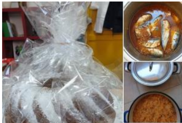
7 - School of Fine Arts, Split, - dinner for the homeless

On 23. of December, high school seniors of Ivan Lucić have made a donation to "Dječji osmjeh" association in Trogir - lots of candy.