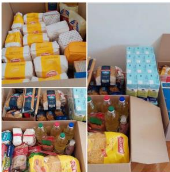
1 - SŠ Tina Ujevića, Vrgorac - Solidarnost na djelu

We participated in the humanitarian action of the Red Cross and collected selected items from food and hygiene packages in order to meet the basic needs of socially vulnerable groups in Vrgorac.